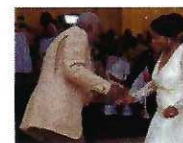
Thank you for loving me unconditionally! I can't wait to dance with you again... ~Laci-Blaine